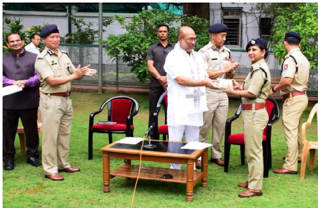
IT News Imphal, June 14: