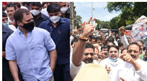
(Left): Congress leader Rahul Gandhi proceeding to ED office in Delhi. (Right): The Congressmen holding protest demonstrations in Mumbai.