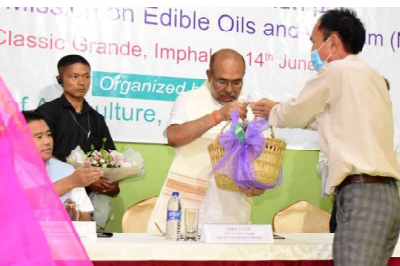
IT News Imphal, June 14:

Chief Minister N. Biren Singh attended the inaugural function of One Day National Workshop on Promotion of Oil Palm in Manipur today at Hotel Classic Grande, Chingmeirong, Imphal East. The workshop was organised by the Department of Agriculture, Government of Manipur under CSS of National Mission on Edible Oils and Oil Palm (NMEOP).